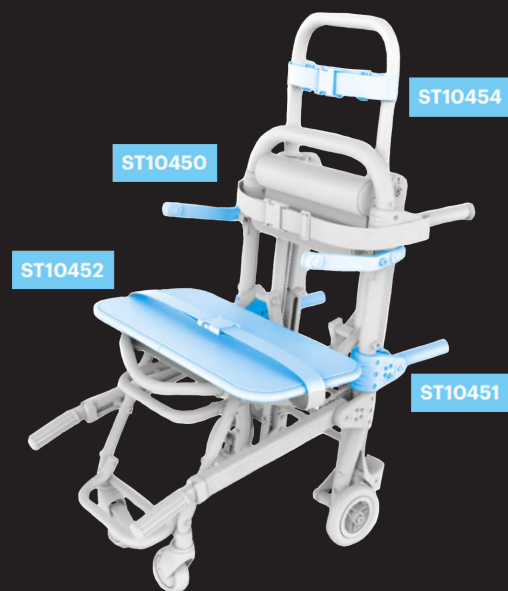
ST10452 Seat XL

It is installed in ambulance, special vehicles or airplanes It helps securing the 4BELL STAIR+ in foldable position to either the wall or the floor.