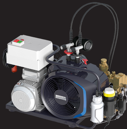
JUNIOR II-E (including accessories)