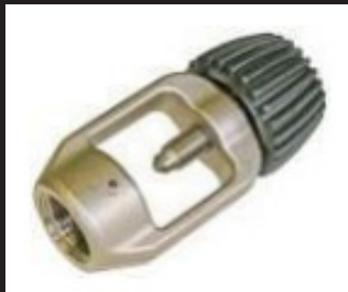
International filling connector

High-quality high-pressure filling hoses made from food-safe and long-life hose material make for flexible and safe handling. Swivel hose connections enable the filling valve to be connected to the breathing air cylinder quickly, easily and safely.