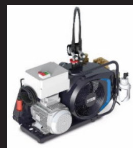
JUNIOR II-E with automatic condensate drain system and control box

The automatic condensate drain removes water from the intermediate separator and the final separator automatically during both operation (every 15 minutes) and shutdown. In addition, the compressor is switched off automatically when the final pressure is reached.