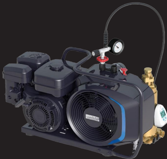
JUNIOR II-B (including accessories)

1 Operating compressors in altitudes > 1000 m AMSL on request