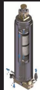
Purification System P21/350