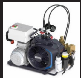
JUNIOR II-E with automatic condensate drain system

The automatic condensate drain removes water from the intermediate separator and the final separator automatically during both operation (every 15 minutes) and shutdown. In addition, the compressor is switched off automatically when the final pressure is reached.