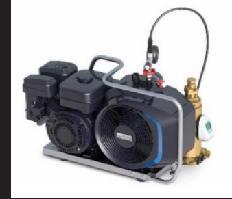
JUNIOR II-W with stainless steel frame

Primary and supporting frame in stainless steel version are available as an option.