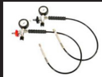
Filling device PN200 (black) and PN300 (red)